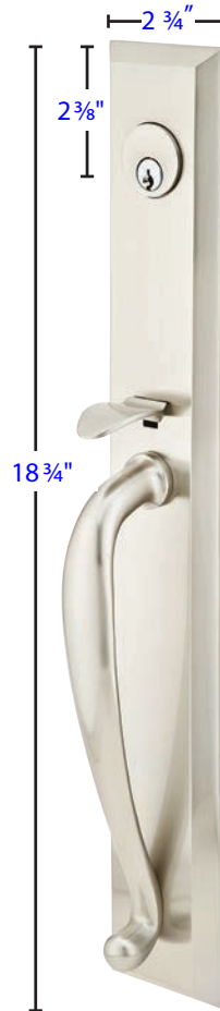
Jefferson Trim Style Part # 4415