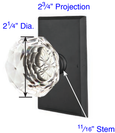
Diamond Crystal (CK) with #3 Rosette