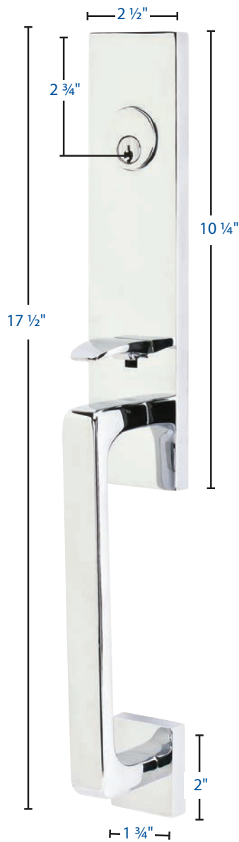
Davos Style Part # 4818