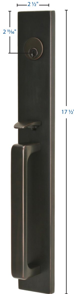
Lausanne Style Part # 4819