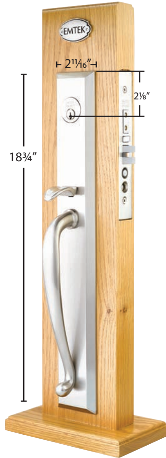
Middleton Trim Style Part # UL 3352