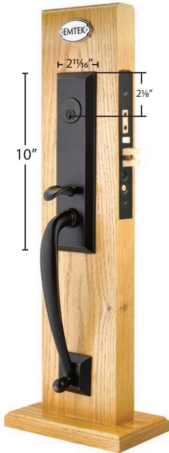
Harrison Trim Style Part # UL 3351